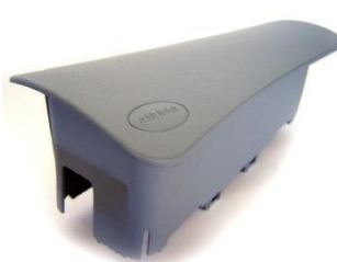
Visual Parts 消费者可视零配件