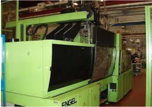
Thermoplastics injection moulding 热塑性注塑