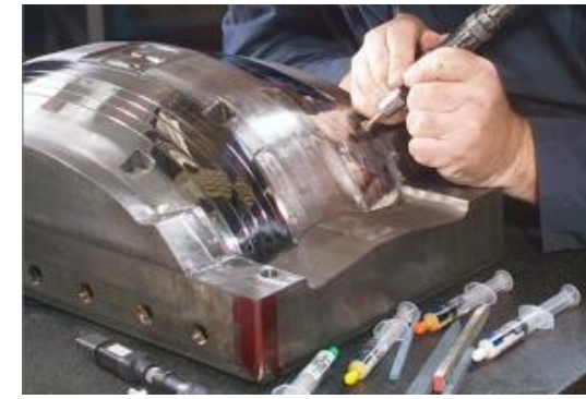
In-house mould maintenance 内部模具维修保养