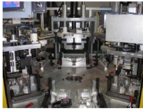
Automated assembly and welding cells 自动组装与焊接车间