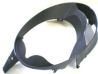
Lighting Components 汽车灯具