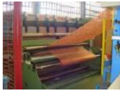
Fabrics Processing 织物处理