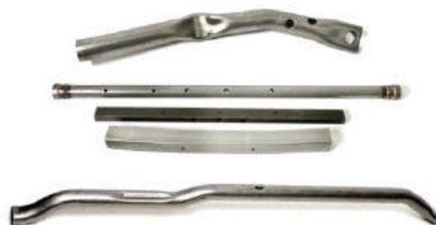
Structural Components 结构元件