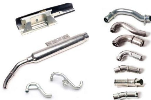
Exhaust Components 排气管元件