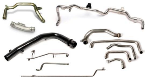
Engine Tubes 发动机管道